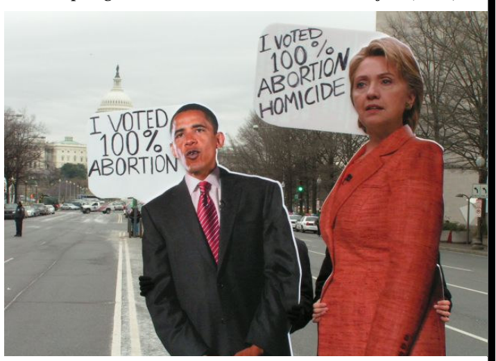
The March for Life attracts a lot of attention. You never know who's going to show up.