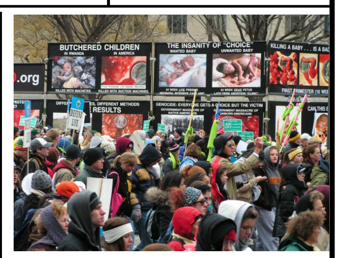
We place the GAP signs right alongside the March route. Tens of thousands of young people learn more about abortion from seeing these pictures than from their Christians schools, from their "pro-life" churches, or from anything they hear at the March.