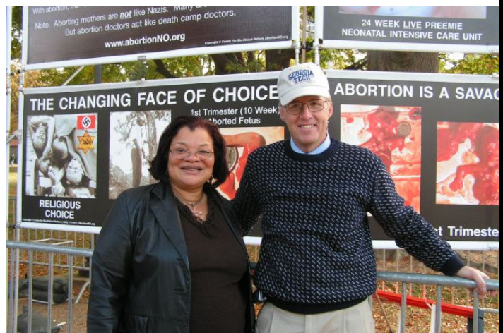
We were pleased that Dr. Alveda King (niece of Dr. Martin Luther King, Jr.) could join us for GAP at Georgia Tech.

Please support our work on a monthly basis. Remember, the life of another of God's children is at stake. Thank you!