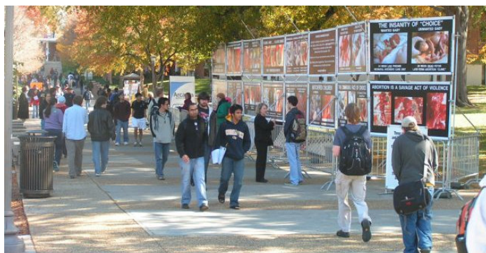
By choosing the right location, we are seen by the maximum number of Georgia Tech students.