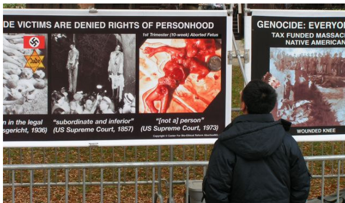
Many students take time to study the pictures in detail.