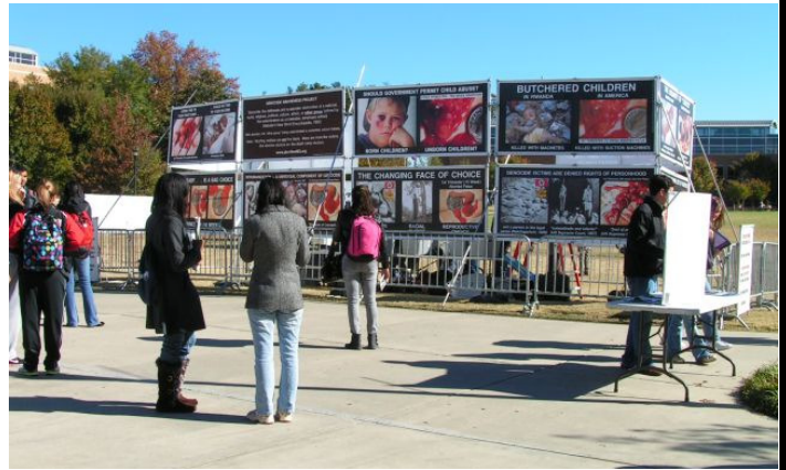
Our double-decker GAP display is an imposing presence in the heart of the campus.

I was supposed to be aborted, but my mom changed her mind. And now I'm a mentor to hundreds of youth around the nation! Thanks, Mom, for changing your mind!