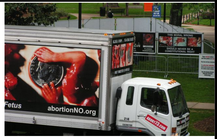
We deployed two RCC trucks to drive around campus for both days we displayed GAP. This allowed us to deliver the truth of abortion to students all over campus.

Keeping an open mind. Some students have open minds, in spite of their ignorance of the facts. One male student was unconvinced, "I believe with all the teenage pregnancies and families living in poverty, abortion should be a consideration." Our volunteer explained that churches, CPCs, and government assistance programs are available for financial help, counseling, and emotional support to those in need. As facts and reason began to take the place of ignorance and emotion, this young man became more open to our message that life, not death, is the best solution to a crisis pregnancy.