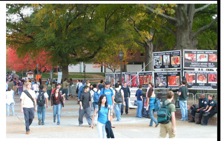
A great location guaranteed that thousands of students saw the facts of prenatal development and abortion.

If you aren't yet on the team, please consider supporting our work on a monthly basis. Another baby's life is at stake.