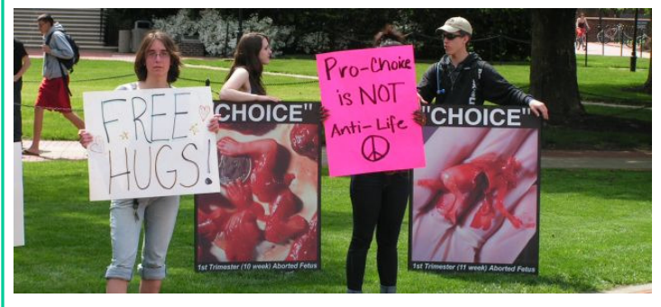
We like to hang out with protesters.