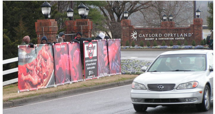
CBR launches Corporate Accountability Project (CAP) at the Marriott/Gaylord Opryland Hotel & Convention Center.